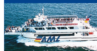
Whale Watching Cruise on Bay St. Catherine.