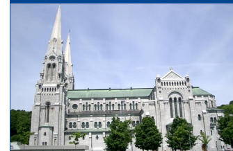
St. Anne De Beaupre Shrine